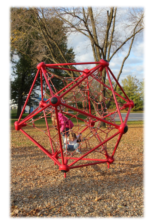
Davis Park Playground