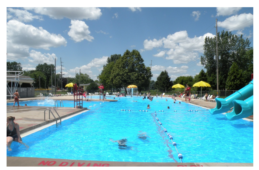
Mount Vernon Municipal Pool, Davis Park

Currently there is one full time employee for the department. Additional parttime staff are usually hired to perform simple and small maintenance items or to act as referees for sports programs. At times, part-time staff are hired to teach a highly skilled class. As the program offerings continue to grow, a permanent part-time employee should be considered to handle the participation and program management aspect. The City should also consider hiring additional maintenance staff as the City acquires more park land. This could be parttime or full-time staff depending on the amount of land that is acquired.