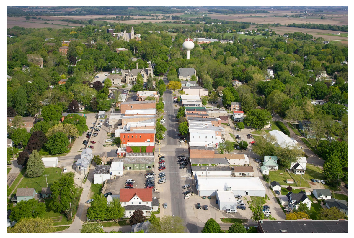
City of Mount Vernon, looking towards Cornell College, © Jamie Kelly

The Master Parks and Recreation Plan is a long-range, strategic planning document intended to guide decision-making for the City for the next 10 years. With any document that utilizes a long term planning outlook it becomes difficult to ensure accuracy. As a result, there is a need for the action plans to be periodically updated and reviewed to ensure that the Plan remains reflective of the current realities and responsive to the changing needs of the community. It is recommended that the Parks and Recreation Board review the Plan on an annual basis and make changes as desired. It is also imperative that the Master Plan be linked to the City's budget process and Capital Improvement Plans and the action plans be reconciled with the City's fiscal capacity.