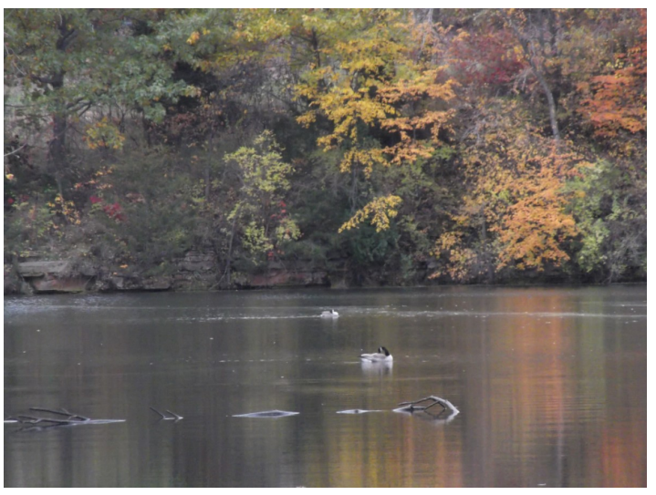
Nature Park Pond/Former Quarry Site

Recreation programming deficiencies and needs were examined, resulting in recommendations to improve the scope of program opportunities. For the most part, the public indicated that the recreational opportunities in Mount Vernon are quite good. The results of a 2011 Parks and Recreation survey indicated that participation is quite high with 202 out of 297 of the responses having participated in one or more of the programs offered by Mount Vernon Parks and Recreation.