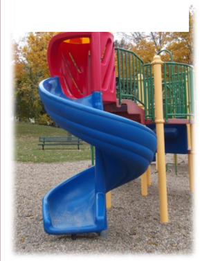
Bryant Park Playground