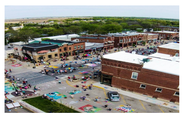
Chalk the Walk 2015, AGI - Aerial Gallery Iowa