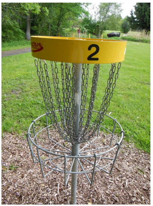
Hole 2, Quarry Ridge Disc Golf Course

Creation of a foot/walking bridge to connect Nature Park with land to the southeast Improve natural trail once Highway 30 becomes a City street