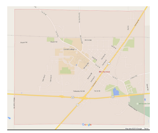
Mount Vernon, IA Road Map 2016, Google

Mount Vernon's neighbor directly to the east is Lisbon. Lisbon's city limits share boundaries with the city of Mount Vernon as well as various dual community events. Its official population in 2010 was 2,152. Lisbon funds its own Parks and Recreation department and programs, including a part-time director.