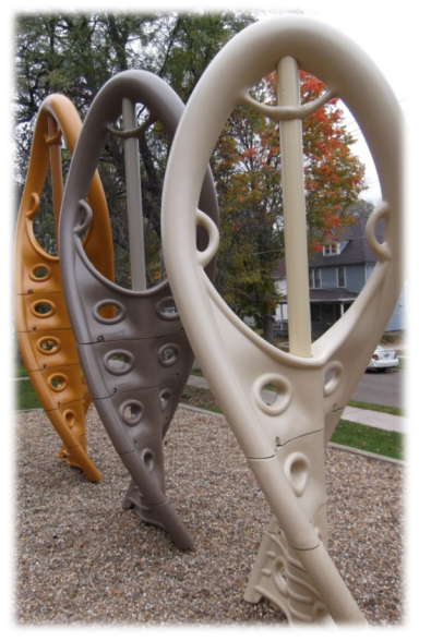
Memorial Park Lower Playground

Trees, Landscaping and Beautification: Mature and younger trees. Terraced landscaping around south side of gazebo.