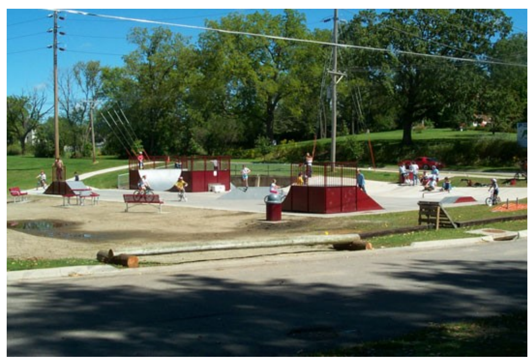
Underhill Skate Park, initial opening

Trail: There currently is a trail that runs on the west edge of this park along parking lot. This trail links with the Sauter Park trail.