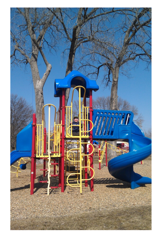
Davis Park Playground

Create trail through park from 8th Ave NW Replace/update ball field lights