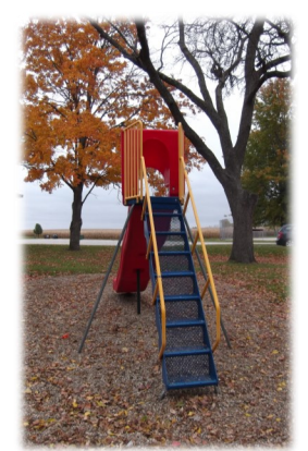
Elliott Park Playground

The City should compare the action plans with its financial capacity and focus on the highest priority items. It is recommended Mount Vernon regularly monitors and updates the Master Parks and Recreation Plan and its action plans.