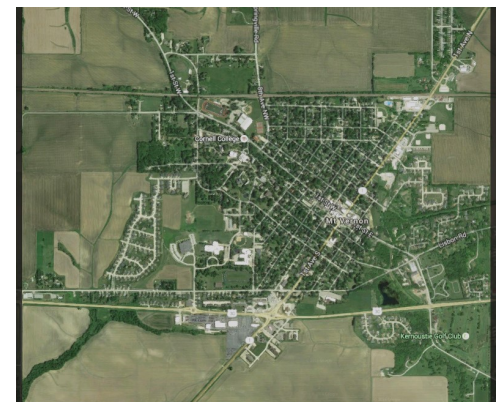
Mount Vernon, IA 2016 Satellite Image, Google

"There are things about living in a small town that you can't necessarily