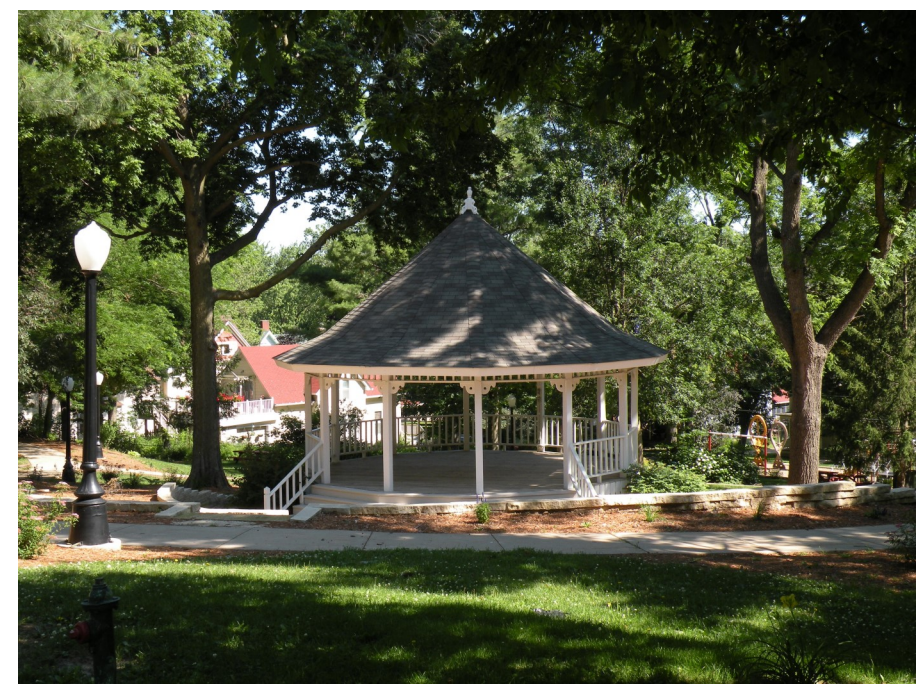
Memorial Park Gazebo

The next pages are the most utilized parks in Mount Vernon's Parks and Recreation program. They are currently developed with specific features, reviews, and recommendations for the City.