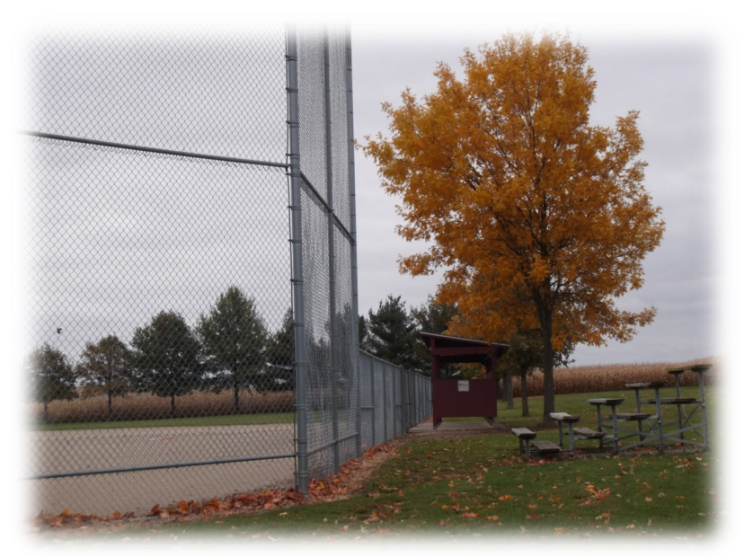
One of the Elliott Park Ball Fields

Trail: There currently is a trail that runs north and south in this park along parking lot. Additional trail land is proposed along with a crossing. This trail links with the Sauter Park trail.