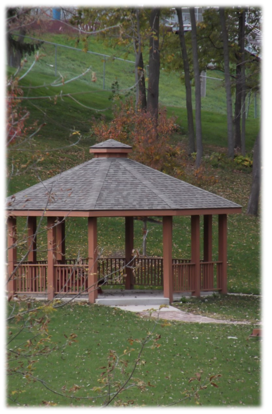
Sauter Park Gazebo

Long Term Needs (3+ years): Consideration of a restroom facility