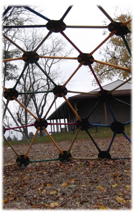
Elliott Park Playground and Multi-use Building

Long Term Needs (3+ years): Ball Field lighting for at least one field Land acquisition to the east