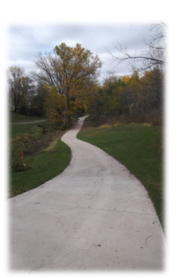
Sauter Park and Trail

One of the major challenges in the area of program delivery is marketing. Without a current marketing plan getting park and recreation program information to new residents has been a challenge. The Parks and Recreation Board should develop a simple marketing plan and review it annually and its effectiveness. Within this marketing plan should be components involving social media, editorials or guest columns in local and regional newspapers, as well as email contact lists. One recommendation is to create a "Welcome Wagon" approach to new residents, by providing them with a packet of information about Mount Vernon Parks and Recreation. This could be done through a similar process used by Mount Vernon- Lisbon Community Development Group or separately. Not only can Park and Recreation information be shared with new residents using this approach, but opens opportunity for sharing other general community information.