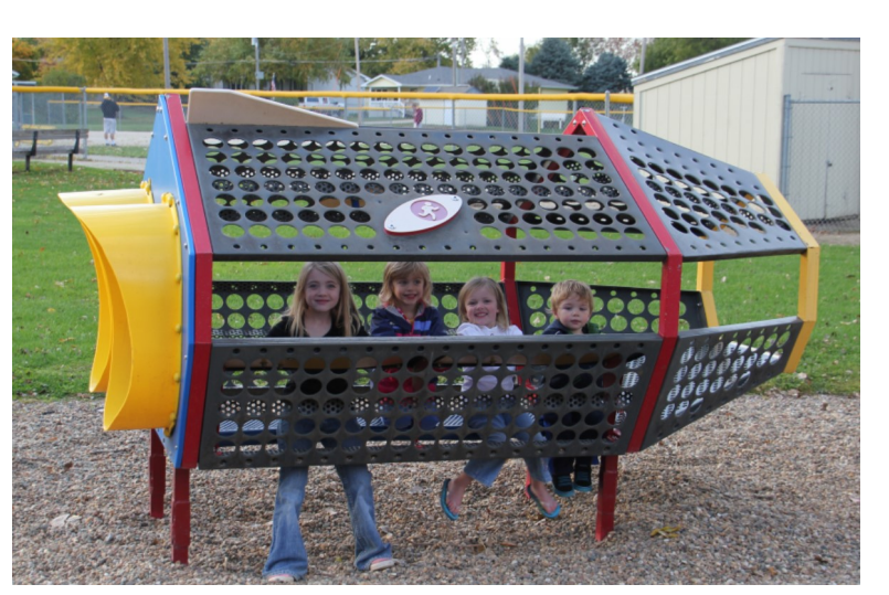
Davis Park Playground with Diamond in Background

Develop effective collaborations and partnerships to enhance our community for current and future generations.